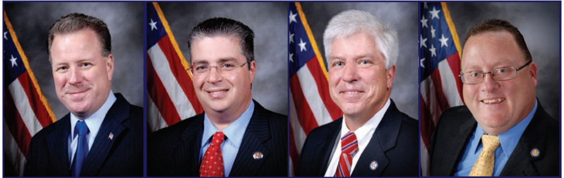
Councilman VacantGroup IV 407-971-5601

Vacancy to be filled on September 20, 2010